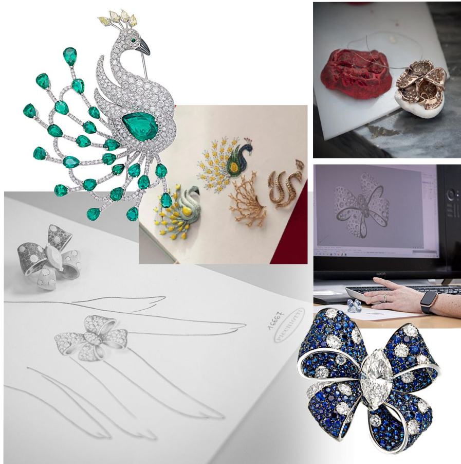
PICCHIOTTI Masterpieces Peacock Brooch , molds and design sketches for peacock brooch, wax mold and rough cast piece, CAD drawing on the computer, PICCHIOTTI Sapphire and Marquise Diamond Fiocco Bow ring , hand drawn design sketch of the Fiocco ring